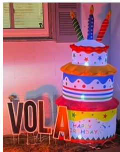
Blow-up cake outside Vola's home.